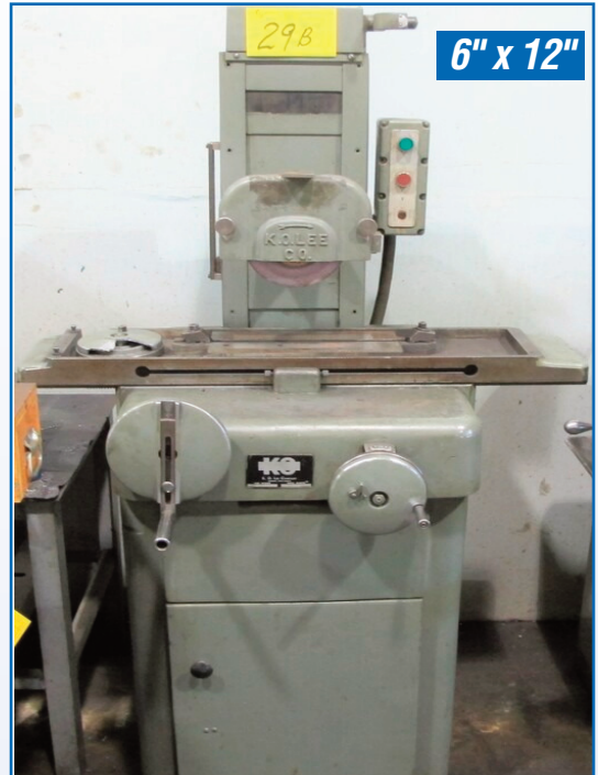
K.O. LEE MANUAL SURFACE GRINDER