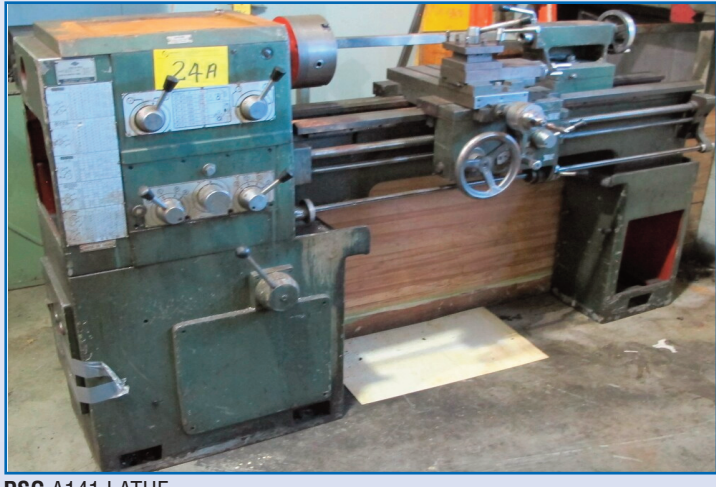
POWERFIST HORIZONTAL BANDSAW