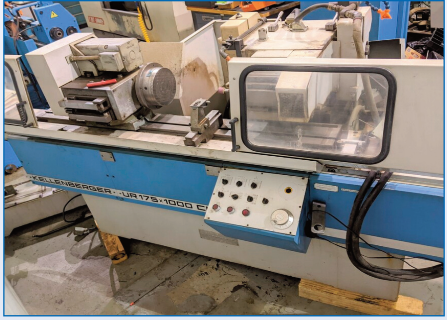
KELLENBERGER UR 175X1000 CNC CYLINDRICAL GRINDER