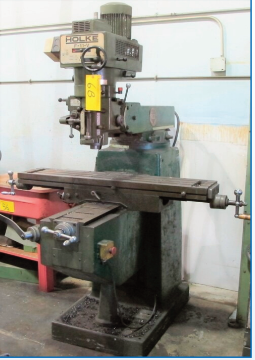
HARDINGE UM UNIVERSAL MILLING MACHINE HOLKE F-11-V VERTICAL MILLING MACHINE