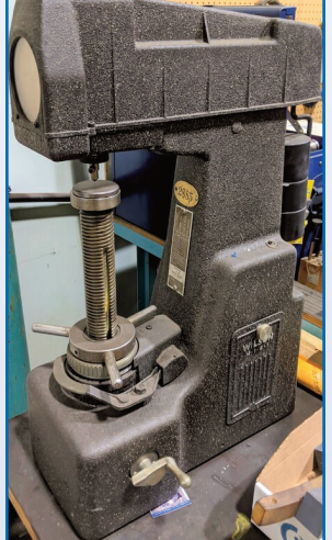
WILSON 3JR HARDNESS TESTER